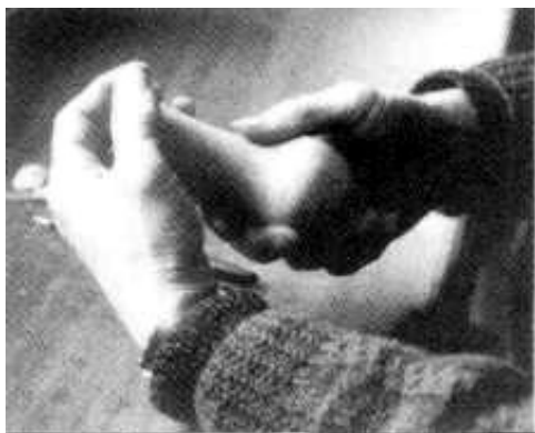
图 8 葫芦研花工艺 (六)盘磨