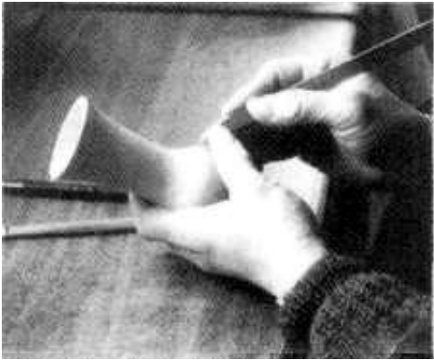
图6 葫芦研花工艺 (四)压研基次