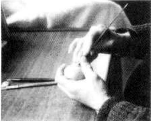
图5 葫芦研花工艺 (三)推研细部