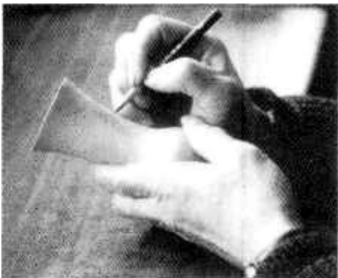
图3 葫芦制花工艺 (一)构轮廓

0 0 x ,±,k,lb@u(JâQwÿ SÖ•(WZ€ miNKriOSÿ Y,s,tY0 s%0 ŒEaÿÿ ÿÿÿÿ0 r[%Ö{ly xèb "•R ÿ Qv_bg "•\ 0 eœR 0 šlZD{I_ 0 x ÿÿ ÿÿv,,]â,zz ^•ÿ QH\ "Å{ W(,k,iN bSz?ÿ u(\ eœR b¼•n^Óÿ Y u(šlZDR x •n^ÓY •ÿ Q•b¼•n^ÓQ... VphHÿ •Ûh7,±~¹\1QøS°Qúÿÿ ÿÿ0 N T R W•b¼Qúv,,~ç`N_N vøT ÿ Y'eœR SiR Qú••~çÿ "•\ Siÿÿ ÿÿQú,±...J0 ,Ôp¹{I0 x ,±]â,zN O$,k,i`hv@ÿ ~İx ,±T „k,i`h—bv,,,± ~¹VphHv,,Qø•wÿ S(—Šmñÿ ,±~¹Qø•w•ŠšØ0 x ,±N NÁ%•S(—mñÿÿ ÿÿfô²zvu;—b\Bkla ÿ `hs°QúY\ 0 •Û•Ñ0 šØON0 mSmáv,,u;—beHÿÿ ÿÿÿÿ (Vp 3 & m d a s h ; 8 )0