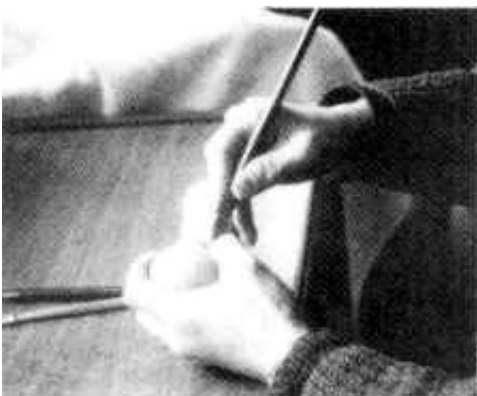
图4 葫芦制花工艺 (二)制轮廓